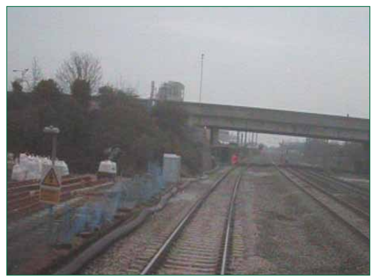
Figure 3: Injured party seen from some distance away on the curved approach

37 Neither the injured party nor the other trackworkers recall hearing a horn blast after the train had passed the survey team. The COSS was the nearest person to the injured party and did not recall hearing the horn while returning to the survey team, but he may have been unable to hear due to the noise of the train passing him. The FFCCTV showed no indication of the lookout responding to a horn blast.