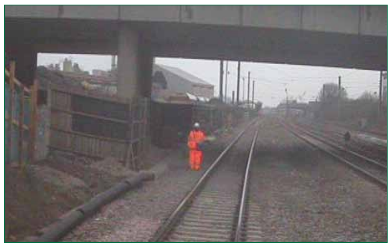
Figure 2: Injured Party standing beside the track immediately before the accident (image from train FFCCTV)