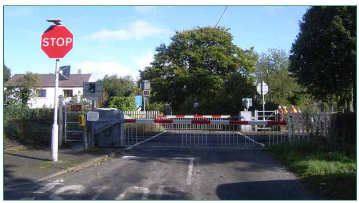
Figure 2: Four Lane Ends level crossing in the direction that the car approached