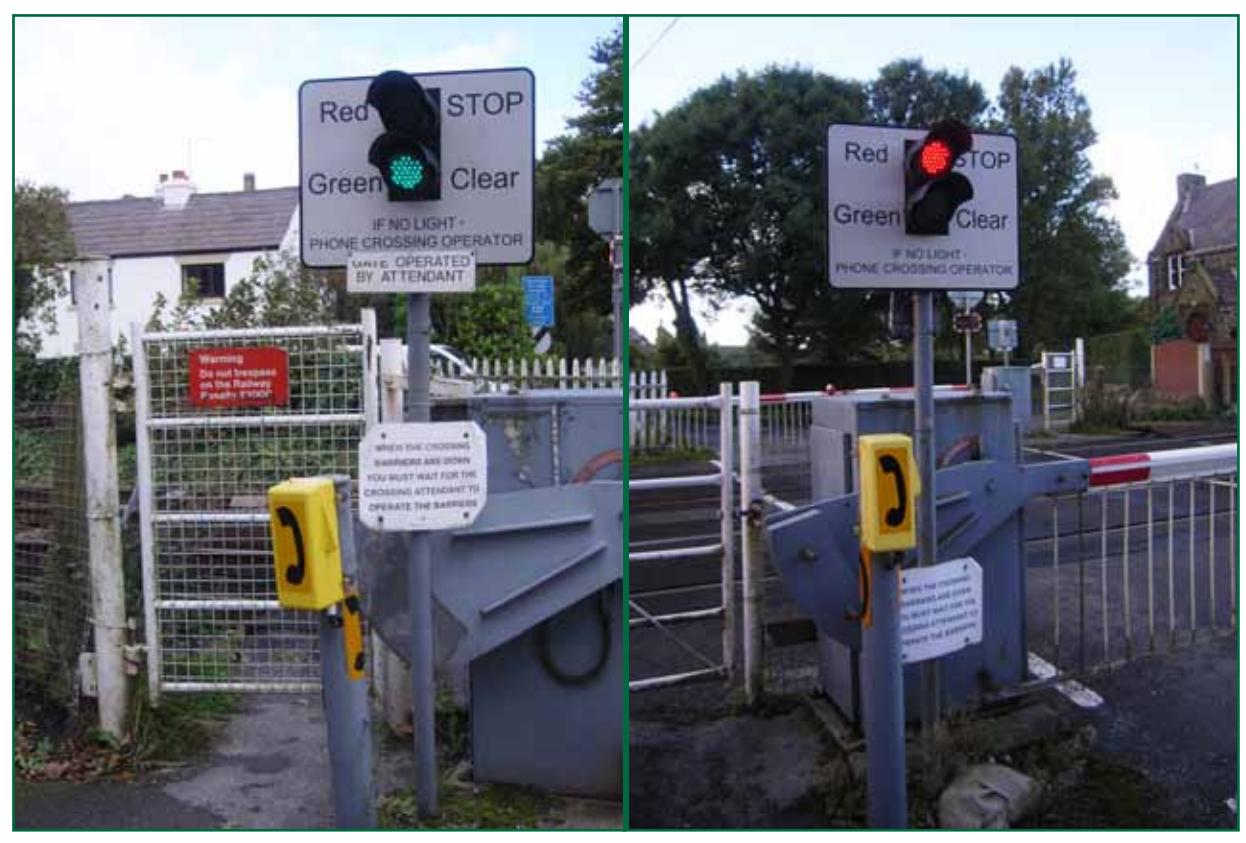
Figure 3: The miniature stop lights at Four Lane Ends crossing