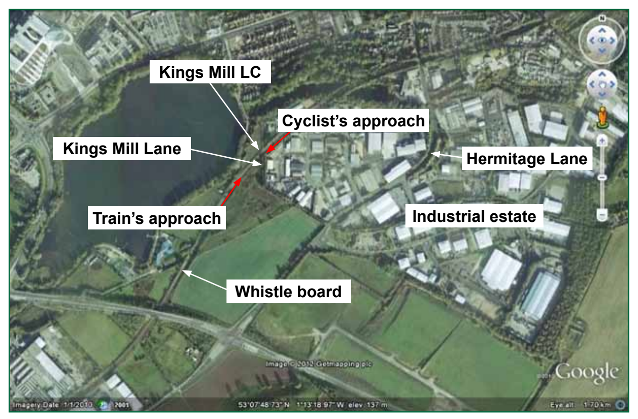
Figure 2: Aerial view of Kings Mill crossing and surrounding area

8 The crossing is on the edge of the built-up area of Mansfield: there is open country on the south-west side, housing and light industry on the north-east (figure 2), and a large hospital and a supermarket a short distance to the north-west. A footpath which runs alongside the railway joins Kings Mill Lane immediately south of the crossing.