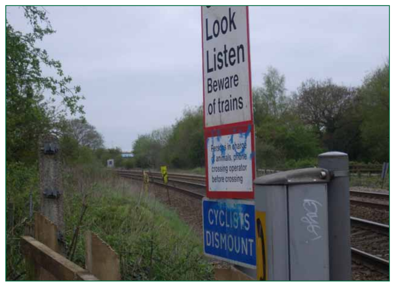
Figure 5: View from up side of crossing looking south-west (towards down trains)