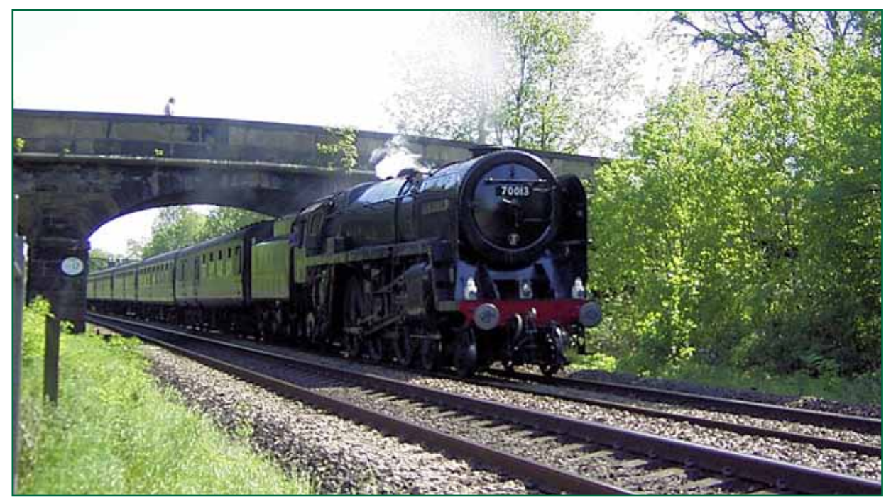
Figure 1: The incident train later in its journey after the diesel locomotive had been detached

<sup>1</sup> Steam locomotives operating on the main line network are often accompanied by a support coach conveying the locomotive support crew and any necessary maintenance equipment.