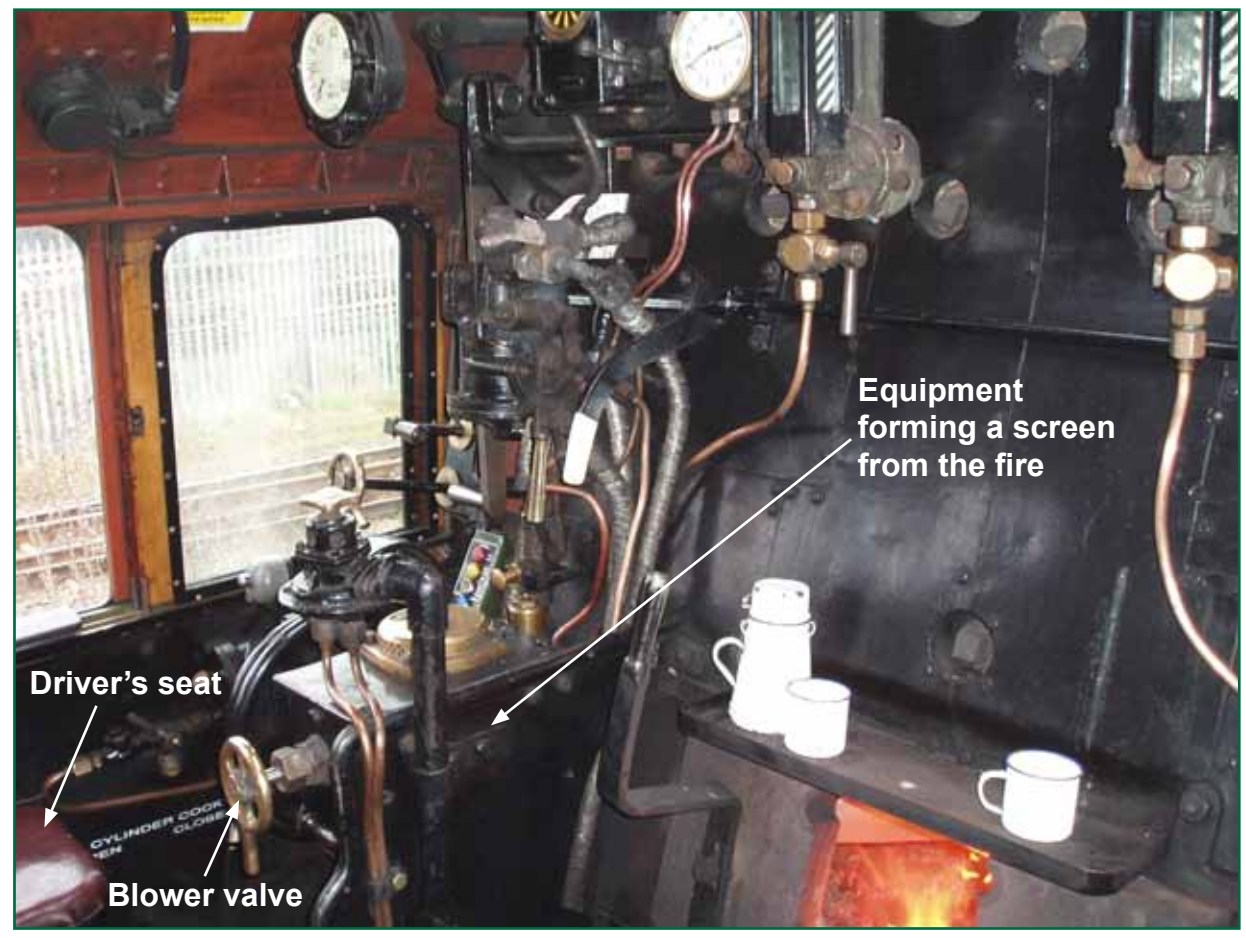
Figure 4: Cab interior of 70013