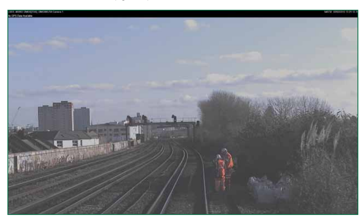
Figure 2: Forward facing CCTV image from train 2N36. The lookout has his back to the approaching train. The COSS is positioned to the right of the lookout. The supervisor is just beyond the COSS and cannot be seen in this image.