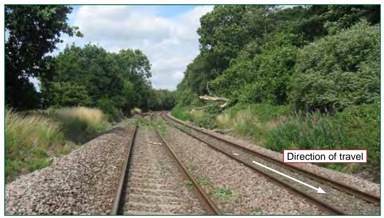
Figure 4: View of the fallen tree after the collision, looking towards London

28 The tree had fallen across the line at 85 miles and 77 chains, and was obscured from the driver of train 1C84 by a left-hand curve (figure 4). The RAIB estimates that the tree might have been visible to the driver for five to six seconds before the collision occurred. The driver immediately applied the emergency brake using the brake control handle; this was recorded by the on train data recorder (OTDR) two to three seconds before the collision, which happened at 14:09:22 hrs.