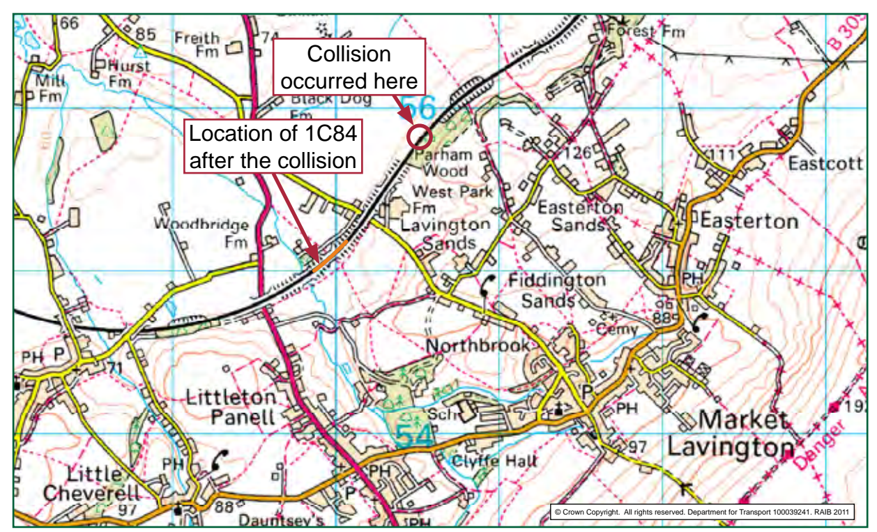
Figure 1: Extract from Ordnance Survey map showing location of the accident

7 At 14:09 hrs on Saturday 10 July 2010, the 13:06 hrs First Great Western (FGW) service from Paddington to Penzance (train reporting number 1C84) was approaching the Lavington area on the Down Westbury line at about 92 mph (148 km/h). On rounding a curve, the driver saw that the line was obstructed by a fallen tree. He applied the emergency brake but the train collided with the tree at about 90 mph (145 km/h).