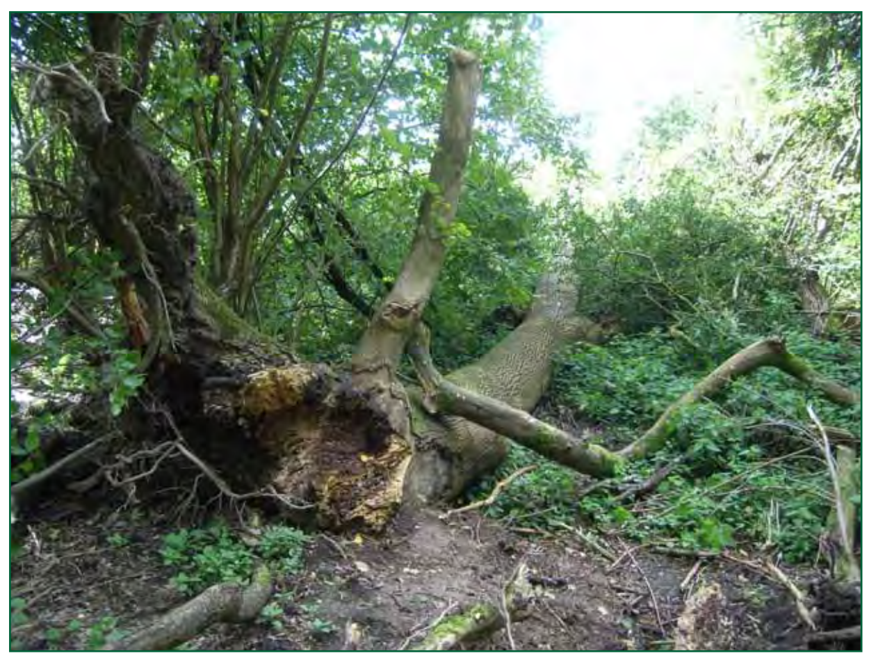
Figure 5: Base of the fallen tree, looking towards the railway

52 There are earlier remains which show that some branches and/or trees had fallen across the boundary fence since 1971, possibly in both directions (ie from the railway side of the fence as well as from the adjacent wood). Previous incidents involving trees at the boundary in this location may have been managed by railway maintenance staff, possibly without discussion with the landowner; the RAIB understands that this approach is common practice. However, the RAIB has been unable to establish what action was taken by any party in relation to these previous incidents at Parham Wood. Historically, local maintenance teams have been responsible for managing lineside trees. The local track section manager has worked in this area since 1976; he has had no experience of any similar incident with trees in that time.