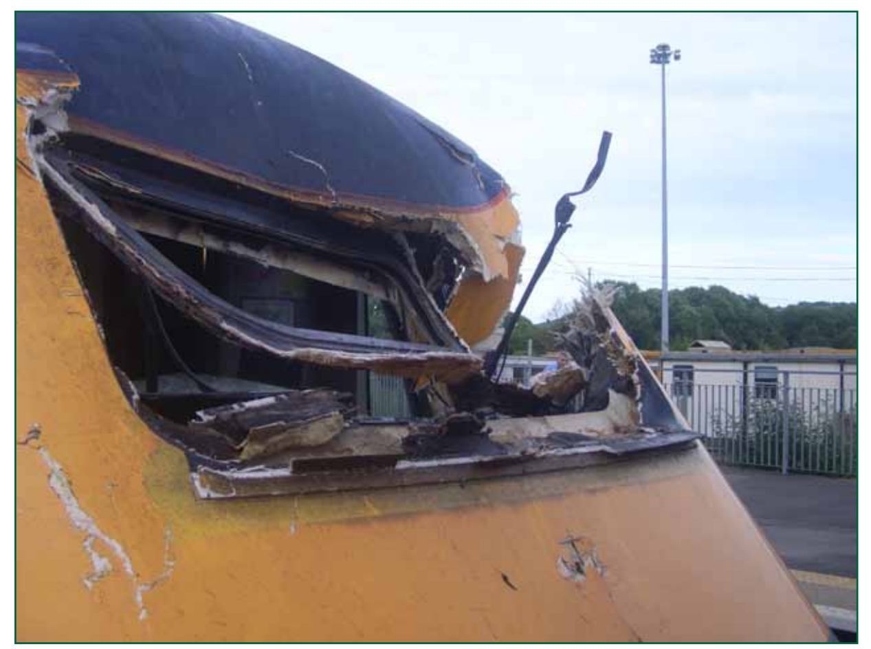
Figure 7: Damage to the driving cab, photographed on arrival at Westbury

70 The cab was struck by the tree at a height of approximately 2.8 m above rail level. The tree penetrated a distance of approximately 1 m through the left side of the cab, starting at the windscreen pillar and extending to the leading edge of the left-hand door pillar (figure 7). The leading left-hand door pillar was cracked but the left-hand driver's side door remained relatively intact. The support provided by the door is likely to have helped the door pillar resist further penetration by the tree. The steel window frame on the left-hand side was distorted and the glass side window had broken and fallen out of its frame.