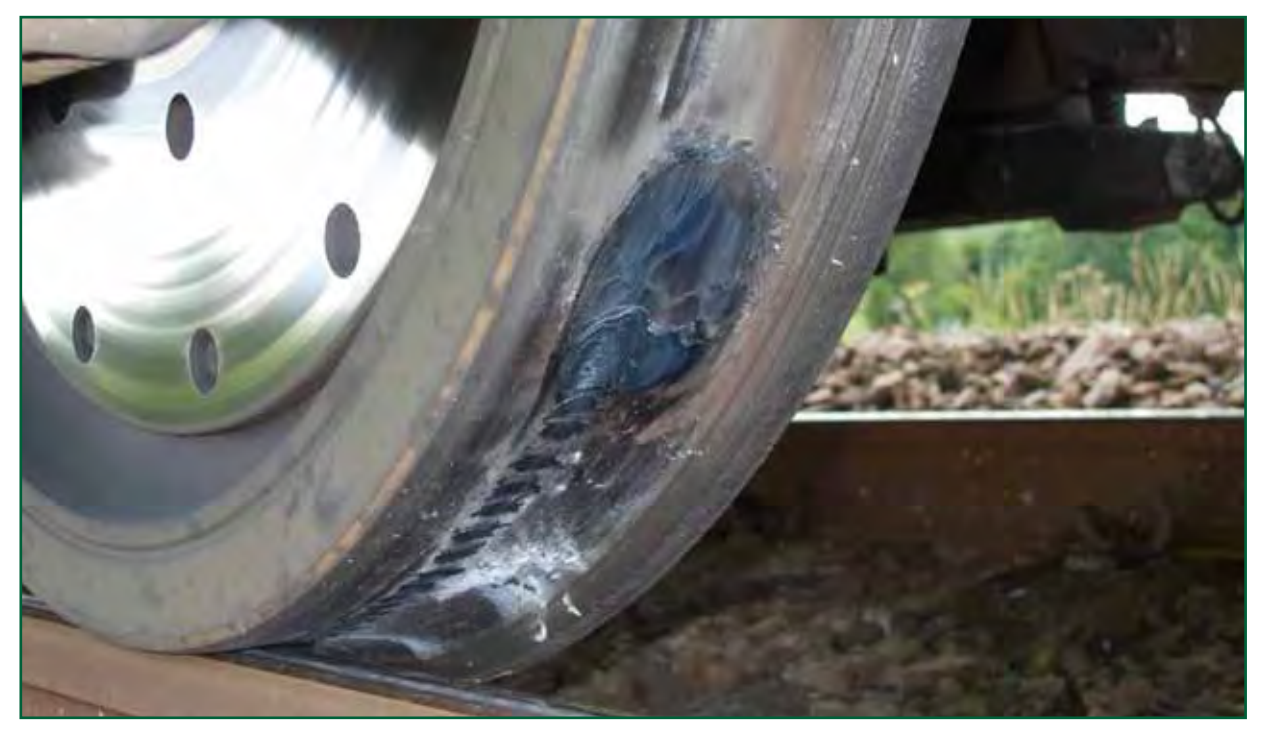
Figure 6: Damage to the wheel tread of HST power car 43041