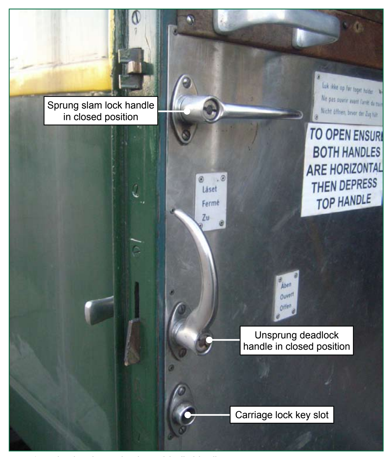
Figure 3: Incident door showing slam door and deadlock handles