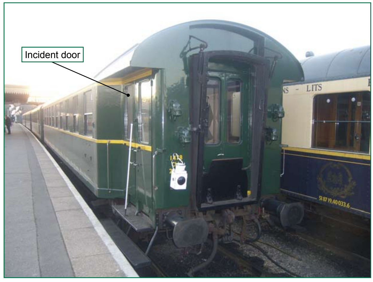
Figure 2: Leading right hand pair of doors on ex-DSB carriage 1478