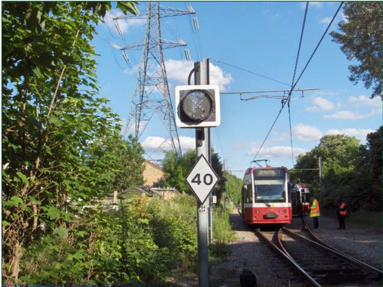
Figure 6: Phipps Bridge soon after the derailment. This picture is not taken from the viewpoint of the driver, and may not represent what he saw on this occasion. The points have been manually changed since the derailment, and are set for the right hand route