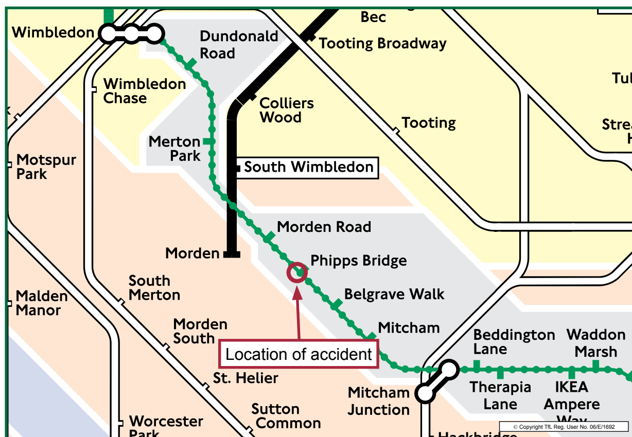
Figure 1: Extract from TfL map showing diagram of Croydon Tramlink system and location of accident