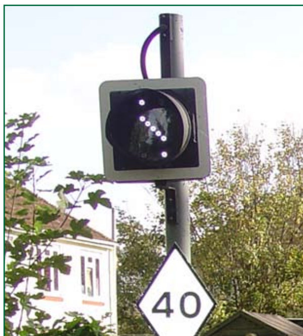
Figure 4: Points position indicator - Points correctly set