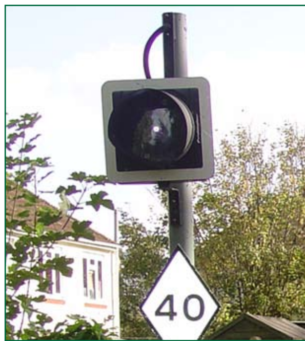
Figure 5: Points position indicator - Points not correctly set