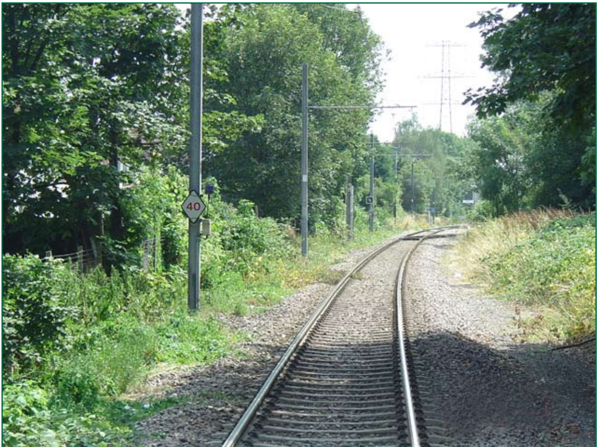
Figure 7: The approach to Phipps Bridge, showing the re-sited speed restriction and the PPI